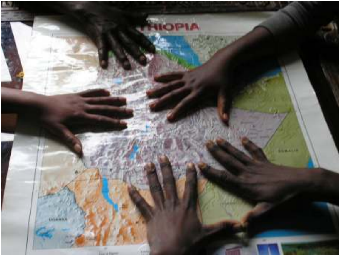
Fig. 4- The Human Migration Map taken from the January 3013, 125 th Anniversary Edition of the National Geographic magazine showing the movement of modern man, Homo sapiens, the progeny of Adam and Eve, from their home in Ethiopia, “somewhere near Addis Ababa” to people the planet Earth.