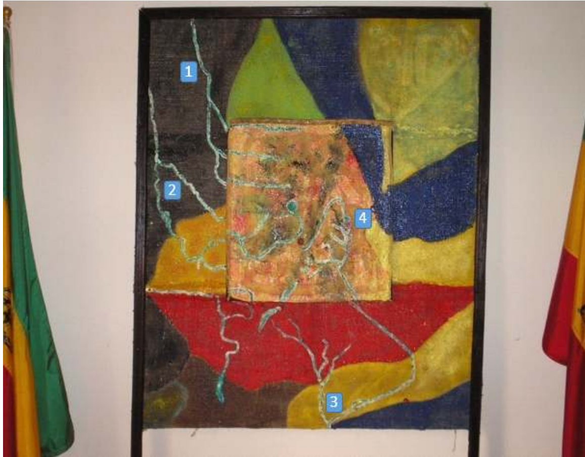
Fig. 3- Depiction by hands, of the same 4 watersheds superimposed on a map of Ethiopia, with fingers pointing “somewhere near Addis Ababa” in the middle.